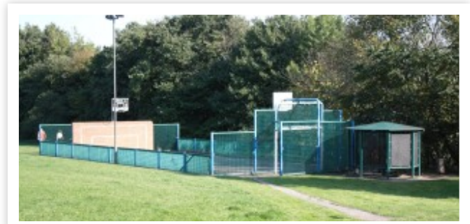
The M.U.G.A. in Silkstone Common rec.

The area also has the Recreation Ground in Silkstone with a football pitch and a cricket pitch. Membership of the clubs is open to non-Silkstone residents. Other areas of importance are the children's play areas located at Manor Park, Broad Gates and Martin Croft. In Silkstone Common the Recreation Ground has a football pitch and the children's play area known as 'Mike's Place'. Both recreation grounds have a "M.U.G.A. (Multi-Use Games Area)